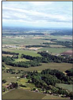
Aerial of McMinnville

Located in the heart of Oregon's wine country, the community of McMinnville combines small-town charm with easy access to the many attractions of nearby metropolitan areas. The dynamic city of Portland is only 38 miles away, and the state capital, Salem, is a 30-minute drive.