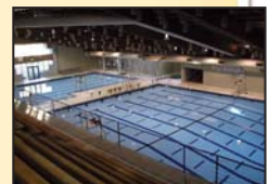
McMinnville Aquatic Center