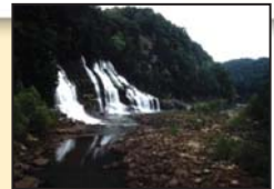
Fall Creek Falls