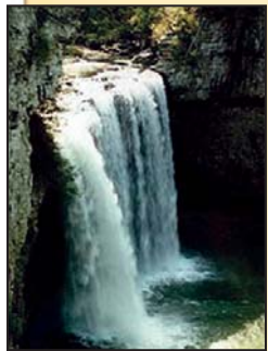
Fall Creek Falls

Located on the left bank of Calfkiller River, in a valley at the foot of Cumberland Mountain, the community of Sparta is a land of green valleys, rolling rivers and majestic hills.