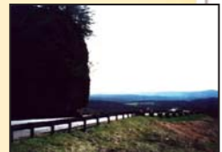
Scenic View of Sparta